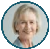
THE HON. JOYCE MURRAY Minister, Digital Government Government of Canada